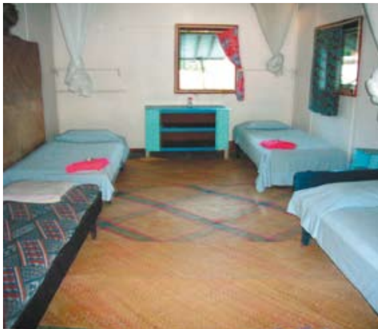
Home away from home: our lodgings at Paradise Sunset Beach Bungalows at Lamén Bay were basic but adequate.

It is always sad to lose a marlin like this, and it was to be our final fishing thrust for the trip. Then, with the wind picking up, we prepared for the long slog home.