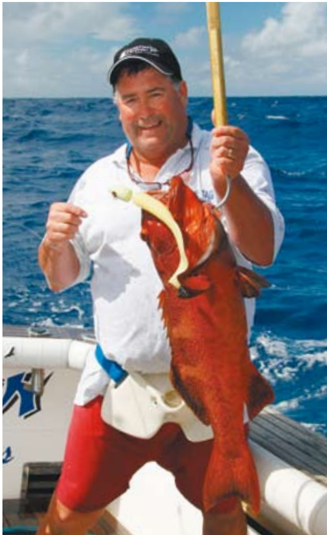
One never knows what will bite next when jigging the seamounts. The writer with a colourful coral trout taken on a Bozo's soft-plastic lure.